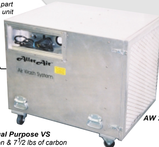
Model AW 2000 Dual Purpose VS HEPA filtration & 7 1/2 lbs of carbon $ 1499.98