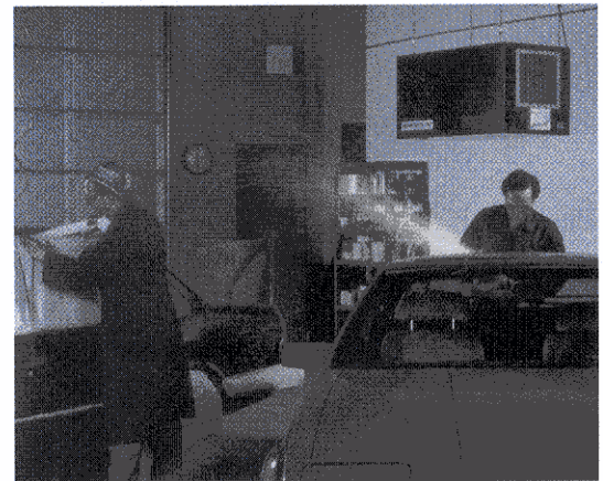
The M67 is perfect for autobody shops.