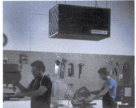
The M67 cleans wood particles and dust from wood shops.